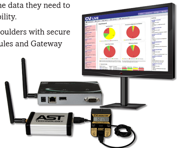
The CVe Live hardware/cloud platform provides real-time monitoring of your tools no matter where in the world they are being run. Click HERE to download the CVe Live Features sheet, or visit cvemonitor.com for additional information.

AST encourages distributors to begin contacting OEM and moulder customers to give them the news about the new CVe and CVe Live. Questions? Contact DeAnn at orderdesk@ASTTech.com .